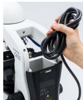
Cable storage compartment