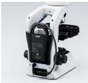
Convenient and easily accessible power cable storage