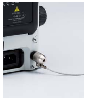
Built-in security slot