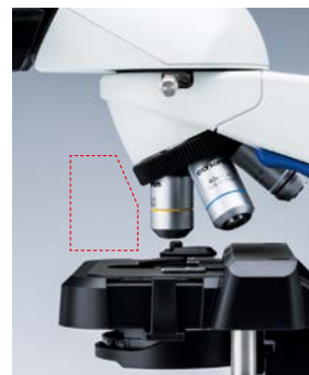
Inward-facing revolving nosepiece