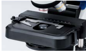
Rackless stage and stage cover