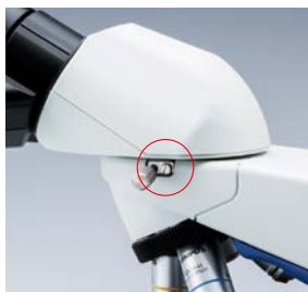
Locking pin for easy binocular rotation