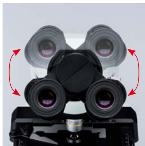
Eyepoint height adjustment