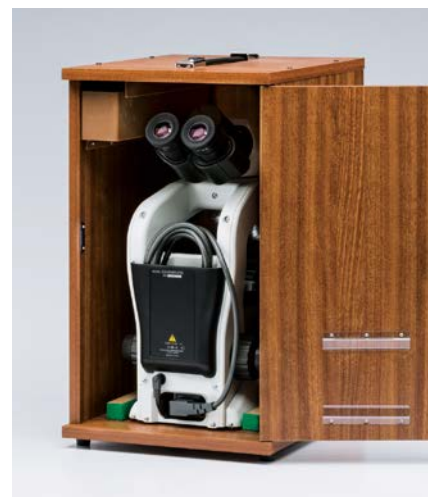
Dedicated wooden case (optional)