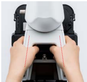
Angled arm enables comfortable carrying