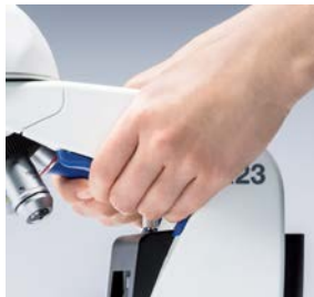
Ergonomic grip for easy carrying